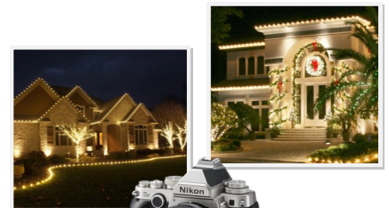
PHOTO CONTEST ENTRY INFO

Send us a photo of an outstanding holiday light display in Edgewater, FL that is NOT IN THE CONTEST and YOU could be a winner too!