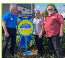
2020 Business Beautification Award Winner Chick-fil-A

Edgewater's Community Beautification Award program recognizes residents and business owners who make Edgewater an even nicer place to live by creating and maintaining attractive landscaping with harmonious design or by beautifying and improving buildings.