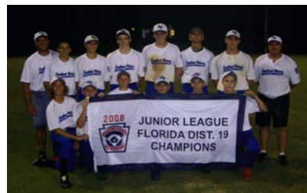
SE Volusia Little League-Home of the 2008 District 19 Junior All Star Champions.