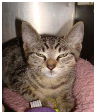
'Herbie' is the original love bug. He, and many others, are available for adoption at the Edgewater Animal Shelter, 605 Mango Tree Dr, 386-424-2442.