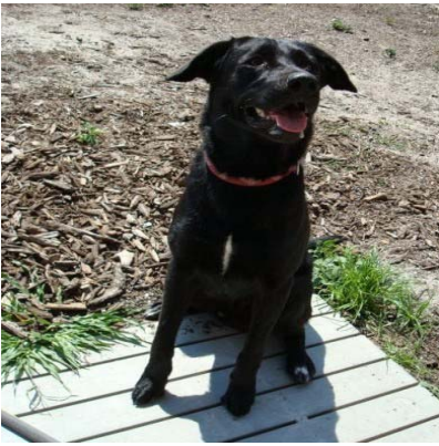
'Ziggy' is a 2 year old, black Lab mix. He needs a chance to show someone what a great guy and loyal companion he is.