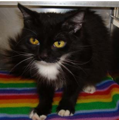
'Clara' is a black and white, spayed female with medium length hair. She wants a new home with someone to love her. These pets are available for adoption at the Edgewater Animal Shelter, 501 Public Safety Blvd., or call 424-2456.