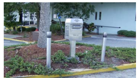
Utility customers have a new after-hours drop box at city hall.

By Payment Drop Box - It is now located in the north City Hall parking lot.