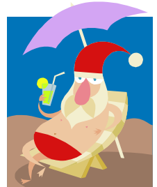
Santa says, "Follow age recommendations on toys for children."